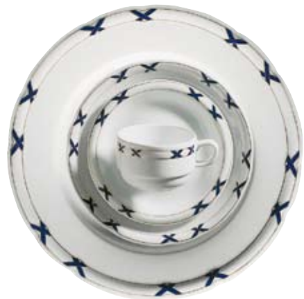
413800 Charlottenburg Blau-Gold - Farbige Kreuze