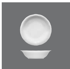
Salatiere rund, Salad dish round, Saladier rond, Ensaladera redonda, Insalatiera rotonda