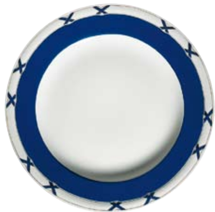
413820 Charlottenburg Blau-Gold - Farbige Kreuze mit Fond Nur auf Tellern und Platten, Only on plates, platters, Uniquement sur les assiettes, les plats, Solo en platos y bandejas, Solo su piatti e piastre