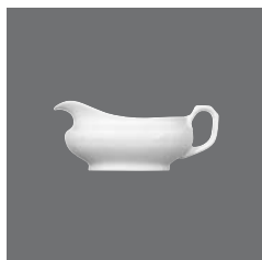
Sauciere, Sauce-boat, Saucière, Salsera, Salsiera