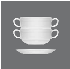
Suppentasse stapelbar, Cream soup cup stackable and saucer, Tasse à consommé empilable et soucoupe, Taza consomé apilable y platito, Tazza da brodo impilabile e piattino