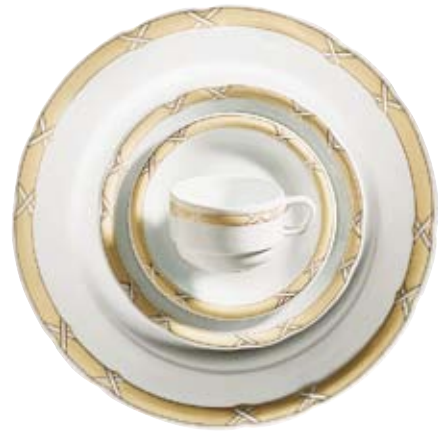
413720 Charlottenburg Gelb-Gold - Farbiges Band