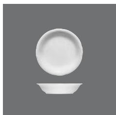
Kompottschale rund, Fruit saucer round, Compotier rond, Compotera redonda, Coppetta rotonda