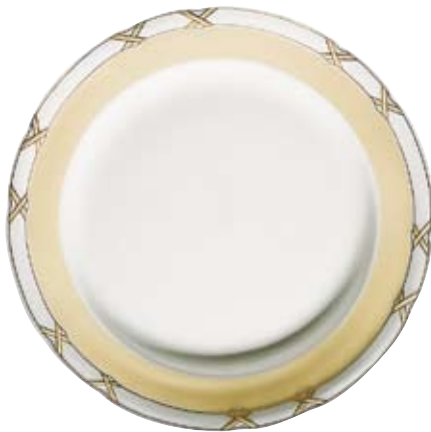
413730 Charlottenburg Gelb-Gold - Farbige Kreuze mit Fond Nur auf Tellern und Platten, Only on plates, platters, Uniquement sur les assiettes, les plats, Solo en platos y bandejas, Solo su piatti e piastre