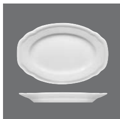
Platte oval Fahne, Platter oval with rim, Plat ovale à l'aile, Fuente oval con ala, Piatto ovale