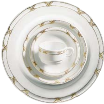
413710 Charlottenburg Gelb-Gold - Farbige Kreuze