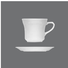
Tasse, Cup and saucer, Tasse et soucoupe, Taza y platito, Tazza e piattino