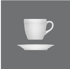
Tasse, Cup and saucer, Tasse et soucoupe, Taza y platito, Tazza e piattino