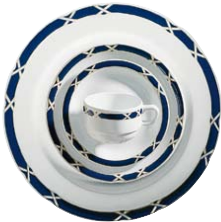
413810 Charlottenburg Blau-Gold - Farbiges Band