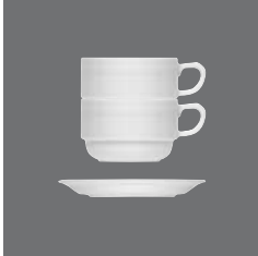
Tasse stapelbar, Cup stackable and saucer, Tasse empilable et soucoupe, Taza apilable y platito, Tazza impilabile e piattino