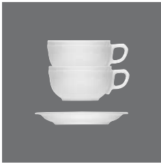
Tasse, Cup and saucer, Tasse et soucoupe, Taza y platito, Tazza e piattino