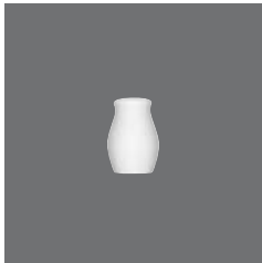
Pfefferstreuer glatt , Pepper shaker plain, Poivrière simple, Pimentero liso, Spargi pepe liscio