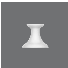
Leuchter glatt , Candleholder plain, Bougeoir simple, Candelabro liso, Candeliere liscio