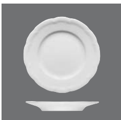
Teller flach Fahne, Plate flat with rim, Assiette plate à l'aile, Plato llano con ala, Piatto piano