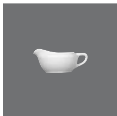
Saucenschälchen, Sauce-boat small, Saucière petite, Salsera pequeña, Salsiera