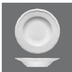
Teller tief Fahne, Plate deep with rim, Assiette creuse à l'aile, Plato hondo con ala, Piatto fondo