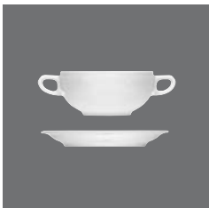
Suppentasse, Cream soup cup and saucer, Tasse à consommé et soucoupe, Taza consomé y platito, Tazza da brodo e piattino